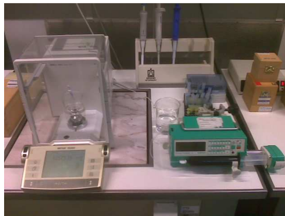
Figure 1. Experimental assembly for the calibration of infusion instruments

The calibration procedure of infusion instruments is based on the IEC 60601-2-24 [3]. The syringe is filled with ultra-pure water without air entrapment. A sufficient amount of water is passed to the tube in order to remove all air bubbles. The flow to be calibrated is then programmed in the pump and the water is collected in a balance (figure 1). The volumetric flow is directly calculated by a computer program written in “LabVIEW”.